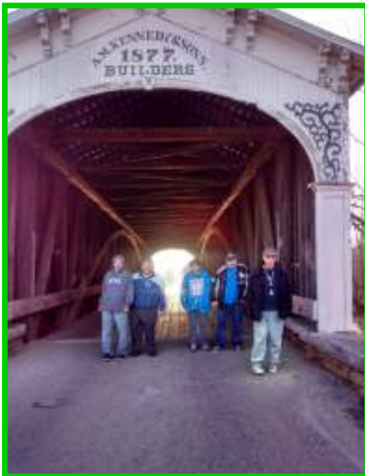
555 & 545 On an outing together